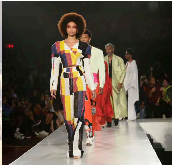
Pyer Moss, SS20, New York