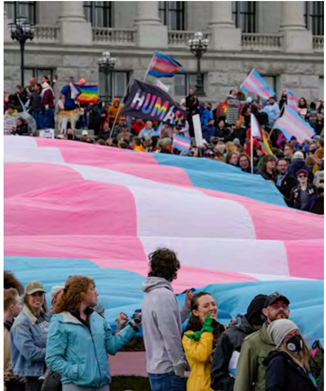
The Salt Lake Tribune