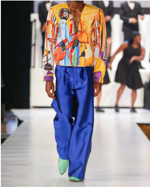
Pyer Moss, SS20, New York