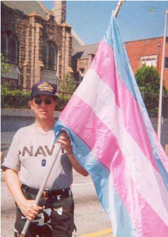
Georgia Public Broadcasting