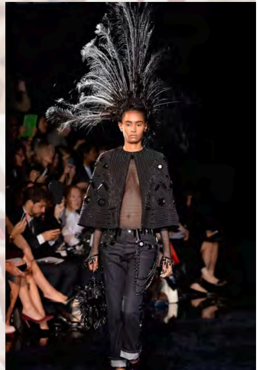
Louis Vuitton, SS14, Paris