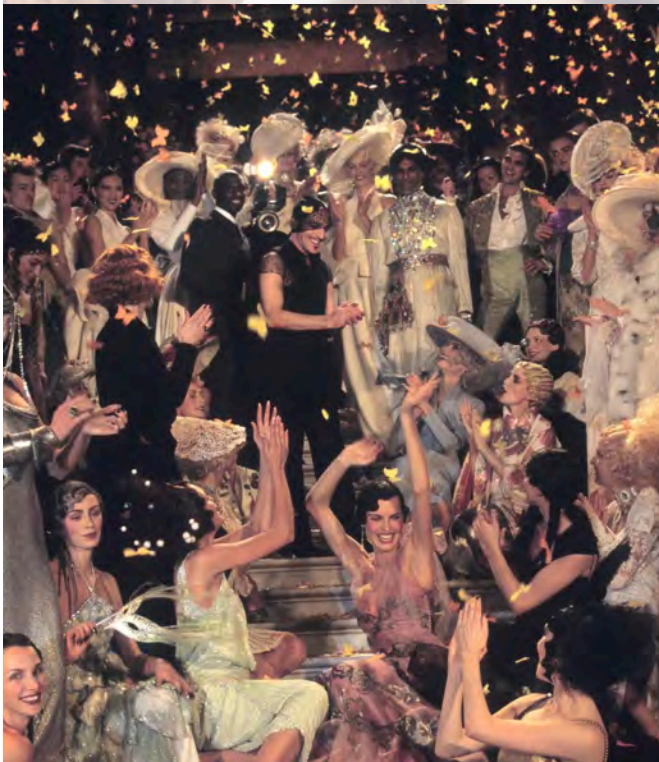
Christian Dior, SS98, Paris