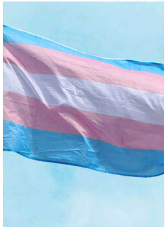
The Transgender Flag