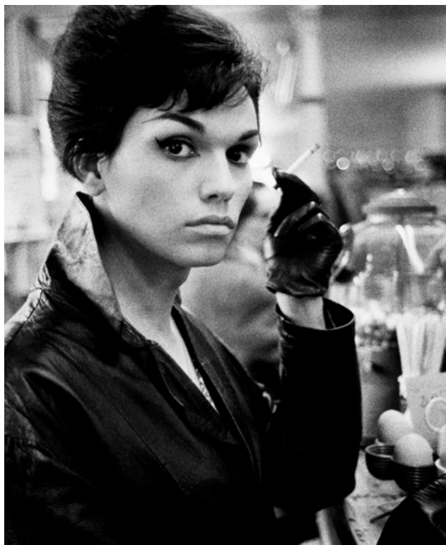
New York Times, Parisian Transgender Woman