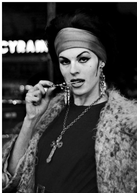
Taylor & Francis Online, 1983